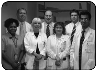
THE CLINICAL CASE CONFERENCE MEETS WEEKLY AND IS ATTENDED BY PHYSICIANS, PSYCHOLOGISTS, PHYSICIAN ASSISTANTS, AND RESEARCH ASSISTANTS

The Clinical Case Conference is held every Thursday morning in the FGIMD Clinic. Clinicians have the opportunity to present difficult cases and exchange ideas regarding patient evaluation and treatment. Participants in the Clinical Case Conference address the physical, social and psychological factors that are relevant to a