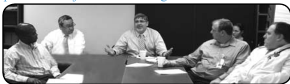
DISCUSSION OF VIDEO INTERVIEW AMONGST FELLOWS, CLINICIANS, AND VISITORS DURING A SKILLS SEMINAR