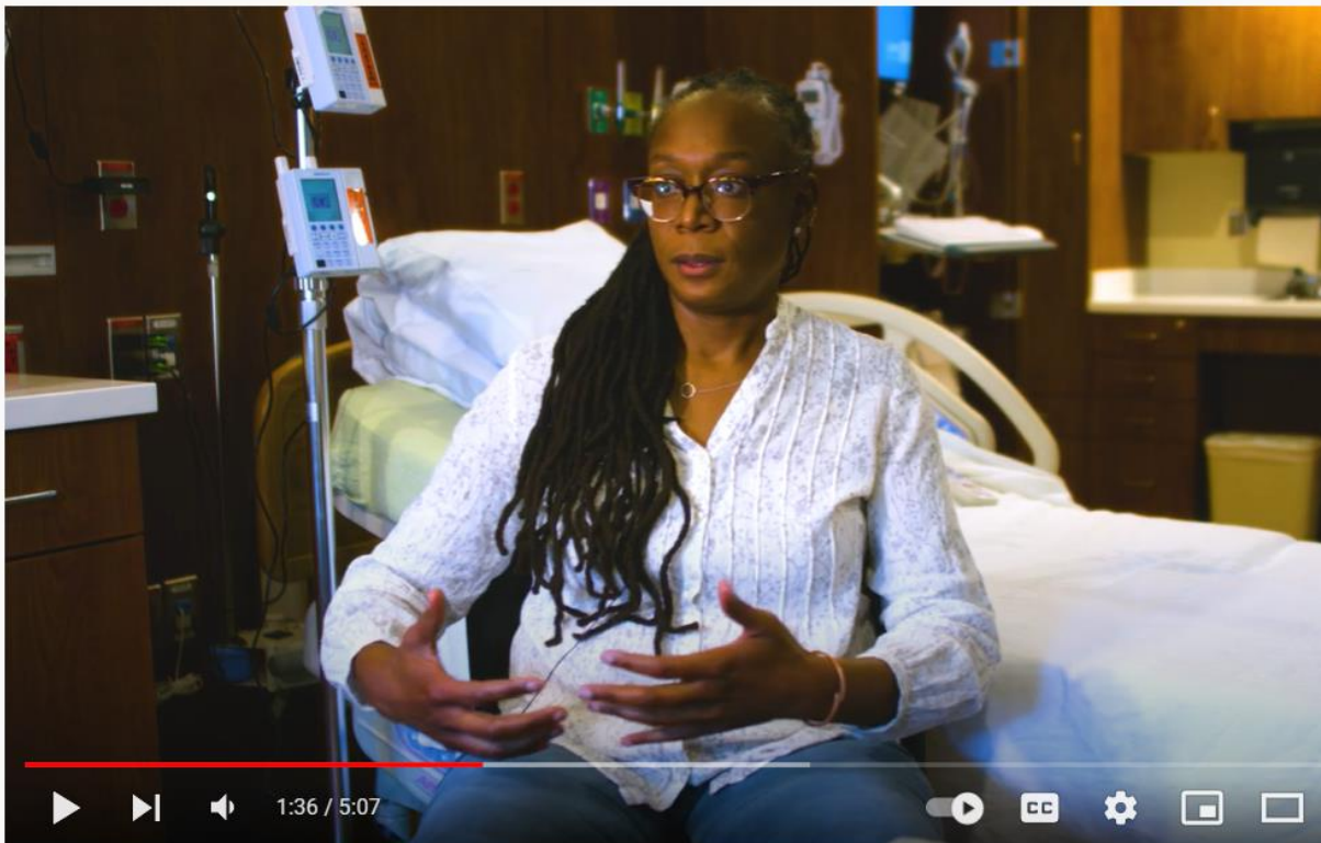
Why Family Medicine?